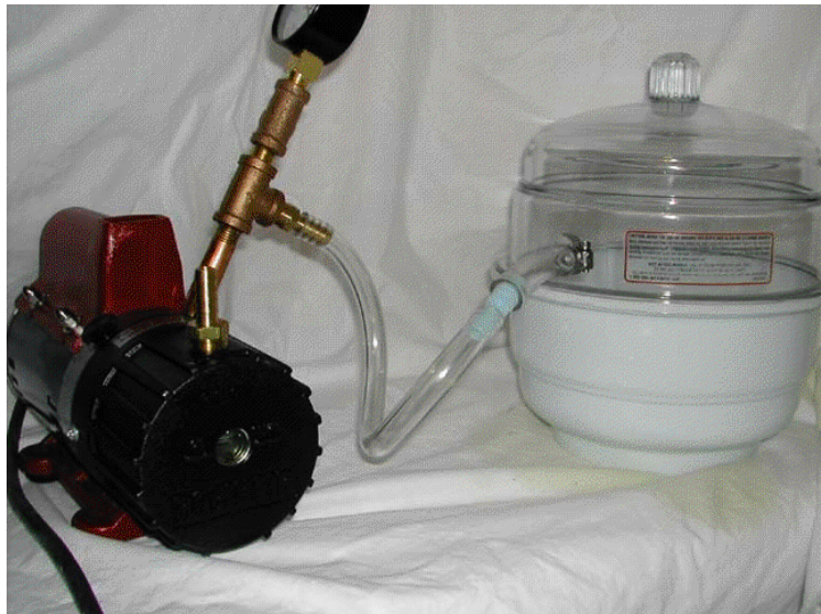
Specially Modified High Vacuum Pump with Manifold, Connecting Tubing and Debubbling Chamber

The picture below shows a typical set up.